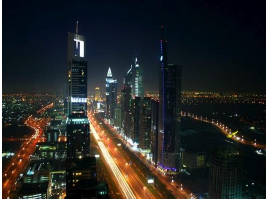
Figure 1 Stylized highrises rise and shine on Sheik Zayed Road

Stylized highrises rise and shine on Sheik Zayed Road, Dubai's ultra-wide and ultra-long High Street. There is little if any functional or bulk zoning and the towers – many over 70 stories – neither taper with height nor space themselves for daylight and air.