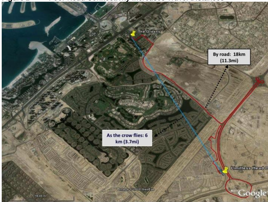
Fig. 2 – The lack of places to turn left tripled the distance of my evening commute home. The morning commute was 1/3 as long, because of more opportunities to turn right. With a grid many times coarser than Manhattan, everyone lives, works and shops on large islands surrounded by a ring of asphalt and sea of sand.