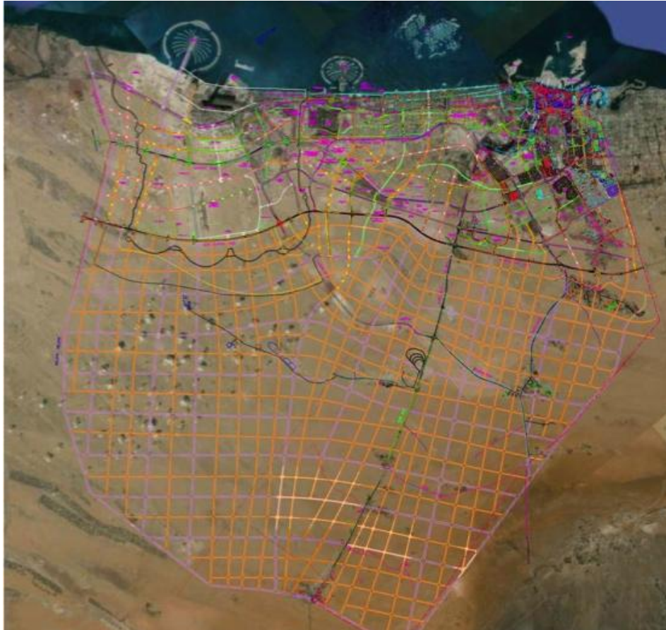
Figure 3 An RTA Plan To Carpet The Entire Emirate With A Supergrid

An RTA plan to carpet the entire Emirate with a supergrid of superhighways is over-the-top and hopefully over its shelf-life.