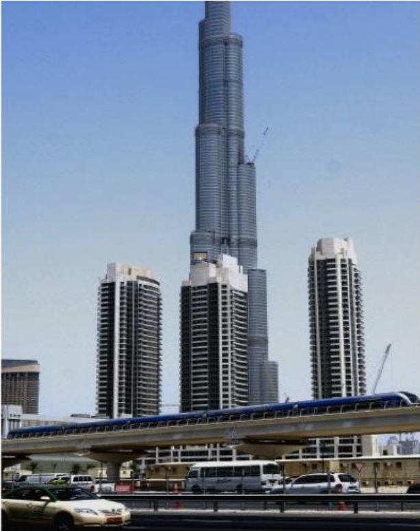
Figure 5 Multiple Modes

Cars, taxis, vans, buses, trucks and Metro stream and sometimes scream by the world's tallest building, which stands higher than the Empire State and Chrysler Buildings stacked one atop the other