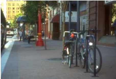
Bikes parked in the "urban furnishings zone" on the City of Portland's transit mall. Portland and a few other cities in the metro area are proactively installing public racks. Check with your city's department of transportation (DOT) to find out about possible on-demand bike rack installation.

◀ Location: To minimize conflicts with pedestrians, racks should usually be located in the strip of the sidewalk near the curb which contains other "urban furnishings" such as lights, trees and transit shelters. Your city or county DOT will have detailed requirements.