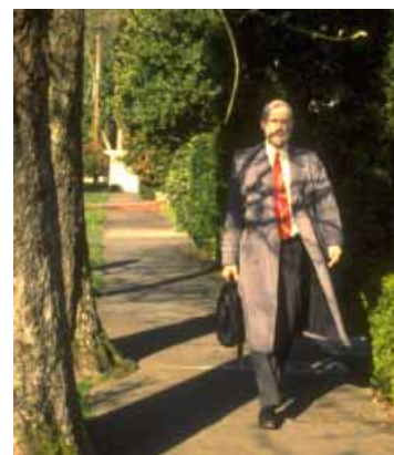
Recent medical studies indicate that as little as 30 minutes a day of brisk walking is enough to maintain optimal health.

▶ A growing number of businesses are finding the benefits of improved health and employee fitness more than pay for the facilities improvements needed to encourage exercise.