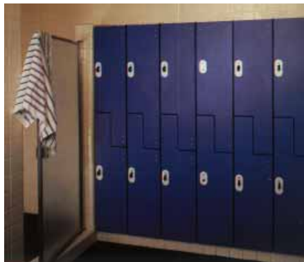
Shower and locker installation. Lockers are available in an almost infinite array of types and sizes. "DesignRite" solid phenolic lockers are pictured here.

◀ Retrofitting restrooms or other areas with existing plumbing usually represents the most cost effective way of installing locker/shower rooms. A number of regulatory issues, including compliance with building codes and the ADA (Americans with Disabilities Act) must be addressed before construction can begin.