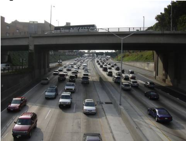
Figure 1 Traffic

“Traffic” refers to vehicle movement. A traffic perspective measures vehicle traffic speeds and volumes, using Level of Service ratings and average traffic speeds as indicators. This tends to favor high-speed, high-volume roadways, resulting in more automobile-dependent transportation systems and land use patterns.