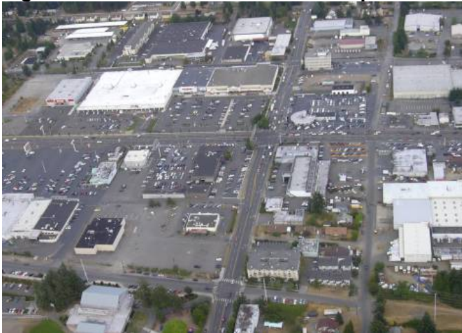
Figure 4 Land Use Affects Transportation

Land use patterns have major impacts on transportation system performance. Automobile-oriented land use has dispersed destinations, wide roadways and a generous portion of land devoted to parking. A more multi-modal land use pattern has destinations clustered into walkable centers.