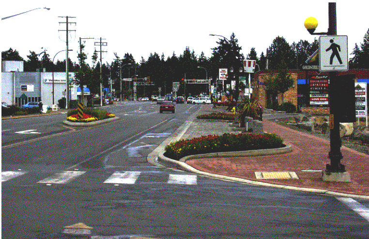
Figure 9 How Transport Is Measured Affects Planning Decisions

Conventional ways of measuring transportation system performance, such as roadway Level of Service and traffic speed, tend to favor vehicle travel over other forms of access. Only by developing better methods of measuring mobility and accessibility will the full value of multi-modal transport systems and more accessible land use patterns, be recognized.