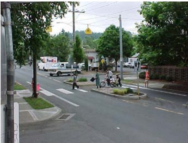
Figure 8 How Transport Is Measured Affects School Location And Design

A school designed for convenient automobile access is located on a busy street, at the urban fringe where there is abundant land for parking. A school optimized for multi-modal access is located in the center of a residential neighborhood, where most children can walk, although this may be inconvenient for access by automobile.