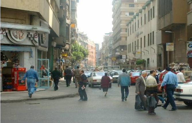
Figure 7 Transportation Decisions Involve Trade Offs

Transportation decisions often involve tradeoffs between different forms of access, such as how much road space to devote to different modes and how much parking to require at destinations. A transport and land use system optimized for vehicle traffic often provides poor access by other modes.