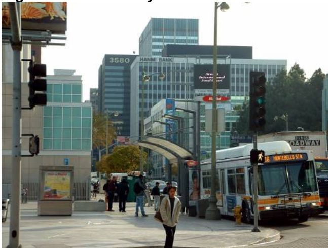
Figure 2 Mobility

“Mobility” refers to the movement of people and goods. This recognizes both automobile and transit modes, but still assumes that movement is an end in itself, rather than a means to an end. It tends to give little consideration to nonmotorized modes or land use factors affecting accessibility.