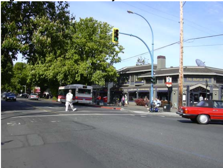
Figure 3 Accessibility

Accessibility reflects both mobility (people's ability to travel) and land use patterns (the location of activities). This perspective gives greater consideration to nonmotorized modes and accessible land use patterns. Accessibility tends to be optimized with multi-modal transportation and more compact, mixed-use, walkable communities, which reduces the amount of travel required to reach destinations.