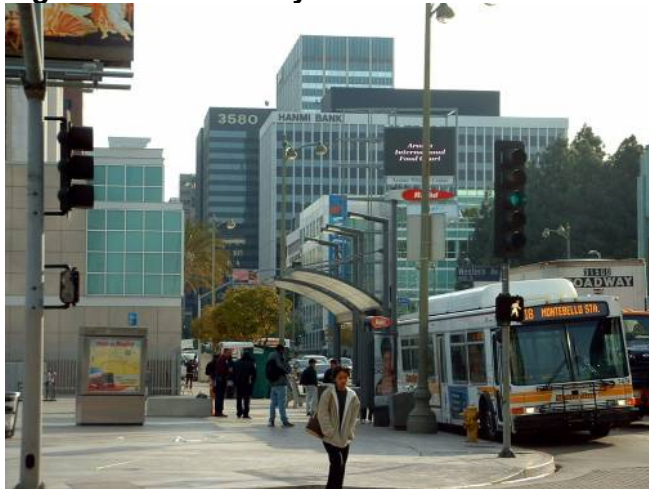
Figure 2 Mobility

“Mobility” refers to the movement of people and goods. This recognizes both automobile and transit modes, but still assumes that movement is an end in itself, rather than a means to an end. It tends to give little consideration to nonmotorized modes or land use factors affecting accessibility.