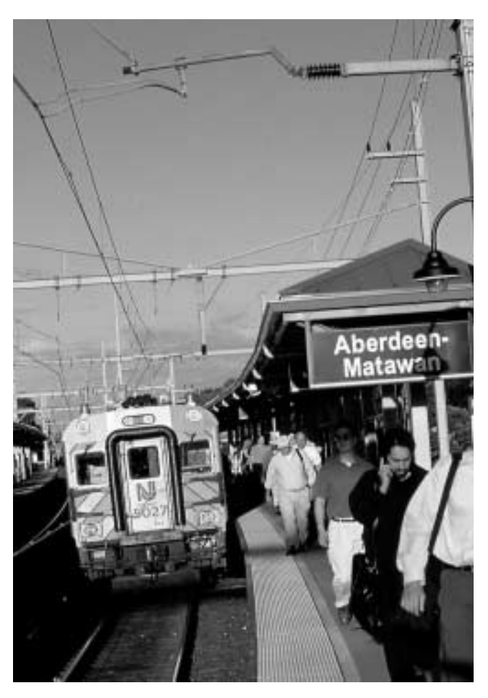
New Jersey Transit has rebuilt a third of its 150 suburban rail stations to provide easier boarding, waiting rooms, and extensive park and ride facilities.

cles, including 1,400 new buses, 200 new single-level rail coaches, and 70 rehabilitated rail coaches in the next two years alone. New double-decker rail cars will be introduced on NJT's congested Northeast Corridor Line from Trenton to Manhattan by 2004 or 2005.