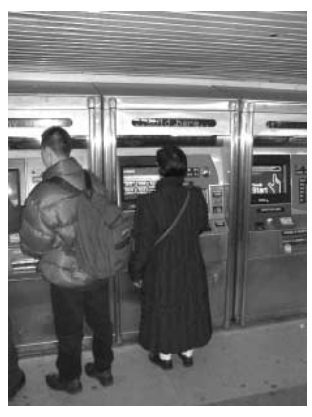
New York City Transit's MetroCard vending machines allow customers to purchase a wide variety of fares and passes using cash, credit, or debit cards.

bus and subway. For many passengers, it represented a 50% discount on what they had formerly paid, and it probably explains why bus usage has risen even more than subway usage. Transfers within the subway system (among lines) have been free for decades, but the MetroCard essentially made free any bus rides to access subway stations. Moveover, for the first time, monthly, weekly and daily passes were introduced in 1998, allowing unlimited travel for frequent travelers. By 2000, 67% of all riders used some form of discounted MetroCard. NYCT estimates that the various discounts reduced the average fare by 22% from 1997 to 2000.