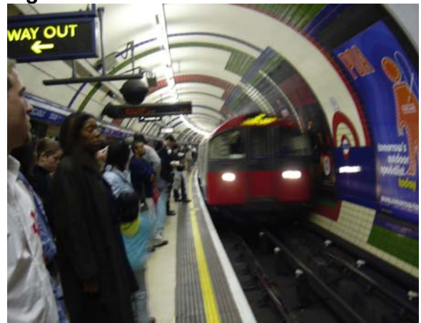
Figure 9 Tube Travel

This shows a major roadway within the charging zone.