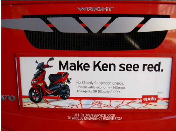
Figure 6 Marketing Mopeds