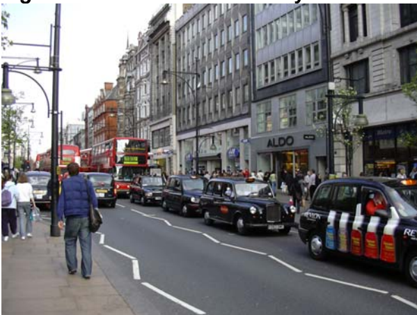
Figure 8 London Roadway

This shows a major roadway within the charging zone.